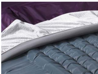
Outer Removable Coverlet and Inner Air-Delivery Cover

Easy Air’s exclusive “Air Diffusion Matrix” Coverlet design maximizes removal of excess moisture (i.e., perspiration) from the user’s skin. Moisture passes in vapor form down through the Coverlet, where a continuous air current from the cover takes it away before it can re-form as liquid.